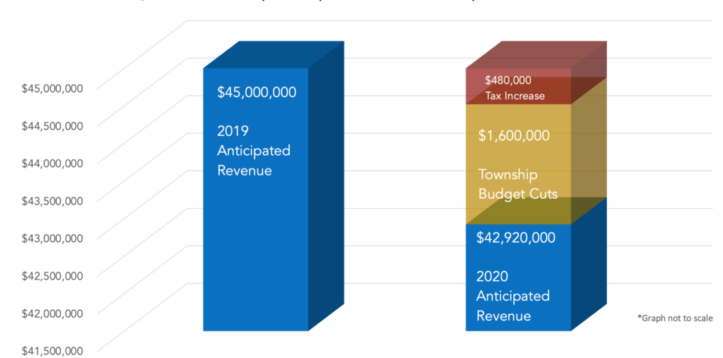
Bridgewater Township Anticipated Revenue Comparison, 2019 vs 2020

We made these difficult decisions so that we pass along the very minimum of difficulty to our community while keeping the Township fiscally solvent. We are proposing a modest 1.94% increase in the municipal portion of the property tax levy for this year. Based on the average assessed home value in Bridgewater, the average tax bill will go up approximately $3 this year. We know that every dollar is important to our residents, especially now, but I am confident that we have minimized their exposure to the Township's fiscal shortfalls.