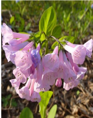
Virginia Bluebells at Duke Island Park